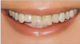
REPOSE (Pre-Op Lip Line)