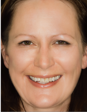
FULL FACE (Pre-Op Lip Line)