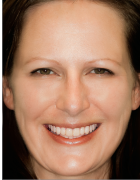
FULL FACE (Temps Lip Line)